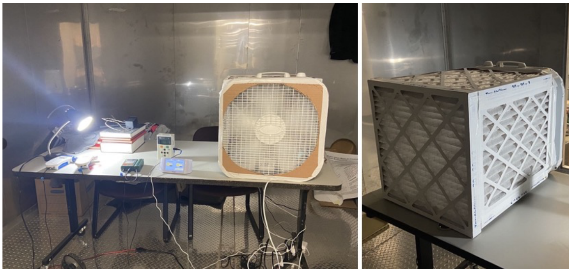
Figure 1. Inside chamber set up for the air cleaner CADR tests

The box fan filter combination included a box fan (Lasko 20 inch Air Circulating Box Fan with 3 Speeds) and five air filters from Tex-Air Filters. Two of the filters (left and right sides) were 16-inch by 20-inch by 1-inch depth MERV 11 filters and three of the filters (top, bottom, and back) were 20-inch by 20-inch by 2-inch depth MERV 10 filters. The filters were assembled to form five sides of a box and taped to the inlet/suction side of the box fan. A cardboard 'fan shroud' was cut to fit the fan outlet. The device was tested once at the highest fan speed.